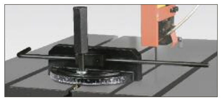
Miter Gauge for Hydraulic Table Shown