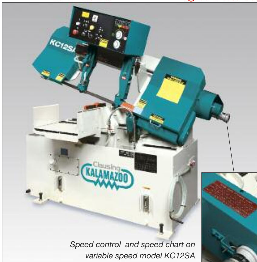
Speed control and speed chart on variable speed model KC12SA