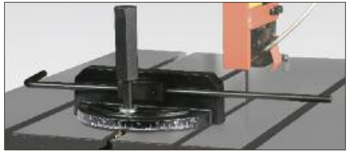
Miter Gauge for Hydraulic Table Shown