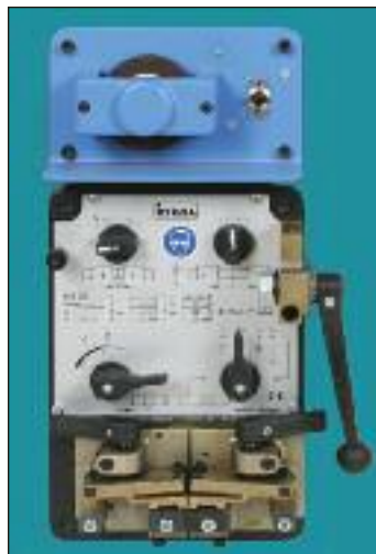
Clausing Installed Welder, Shear, and Grinder. Welder capacity: 1" carbon Blades.